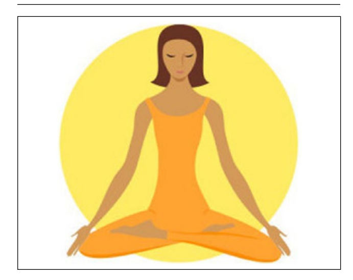
Figure 2. Guidance about Practice Mindfulness Sitting Meditation.

Focus on breathing only Focus on the present moment without judgment Try to enter a state of muscle and logic relaxation May or may not incorporate music May or may not close eyes May or may not sit in Zen position May practice daily or at your own pace